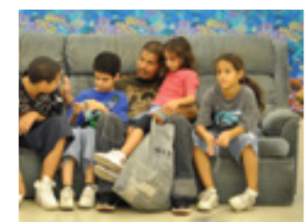
A single dad waiting with his kids to try on shoes.